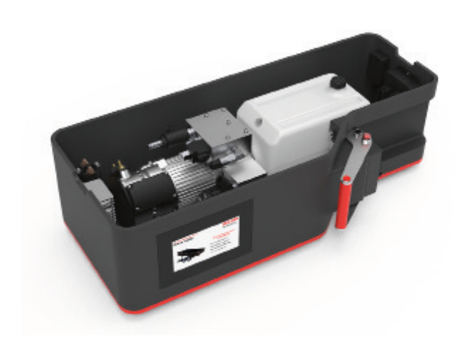
Smart PowerPack S for up to 6 kW (low voltage up to 60 VDC)