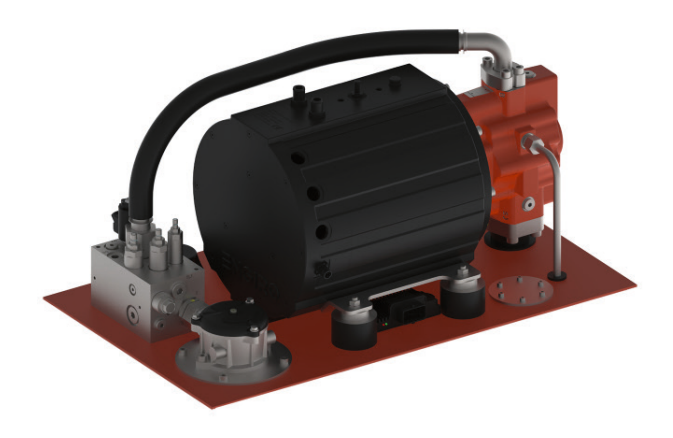
Compact and flexible: the components of a Smart PowerPack from Bucher Hydraulics can also be distributed around commercial vehicles.