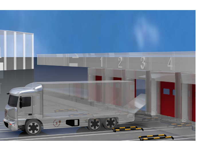
Smaller auxiliary functions also need an eh-PTO, because the vehicle's traction drive is optimized for energy-efficient driving.