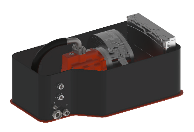
Smart PowerPack L for more than 30 kW (high voltage 400 to 800 VDC)